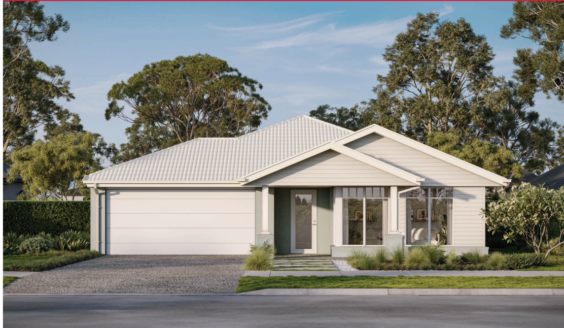
HARDY 25 | ELEVATE RANGE